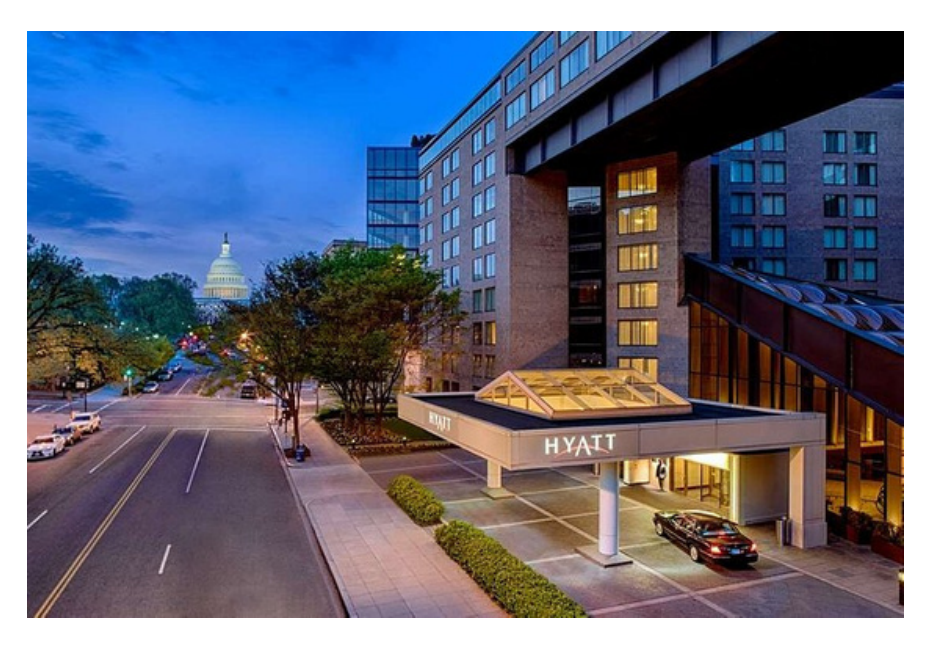
Hyatt Regency Washington on Captiol Hill

400 New Jersey Avenue, NW Washington, DC 20002 Check Availablity